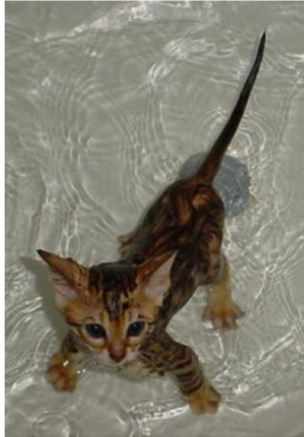
Bathe your cat before and after returning from a show.